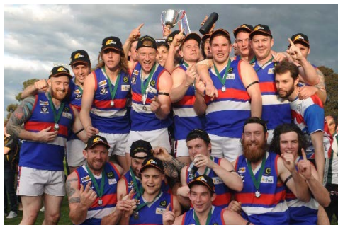
Mid Gippsland FL premier: Newborough