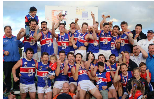
North Gippsland FNL premier: Sale City