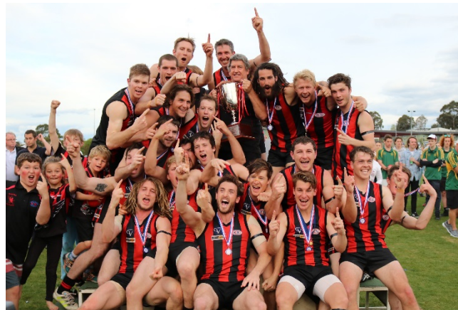
Gippsland League premier: Maffra