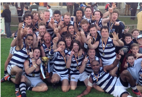
East Gippsland FNL premier: Lindenow