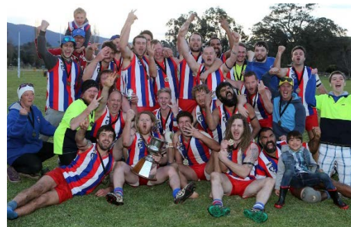
Omeo District FNL premier: Lindenow