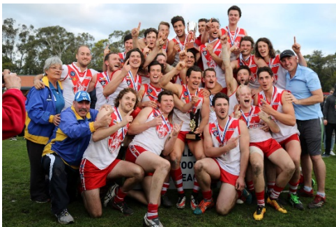
Alberton FNL premier: Fish Creek