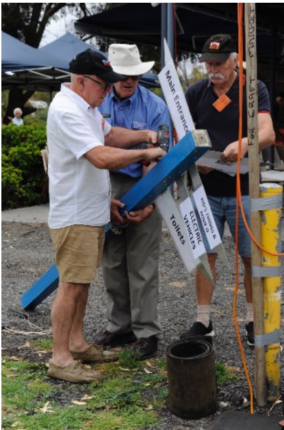
North, South East or West, Only these 3 workers know the best!!

A Snapshot of the 2019 Craft Market Provided by Hotshot Photographer, Mochtar.