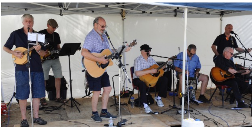
The ShedBoys pumping out a tune!