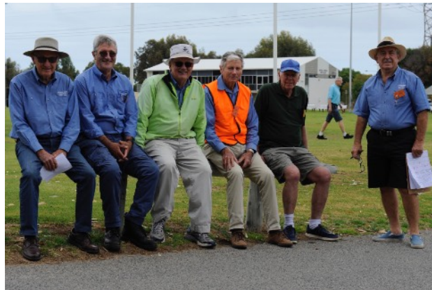
The Welcomin Crew or the Bouncers??? Some gourmet stuff going on here!