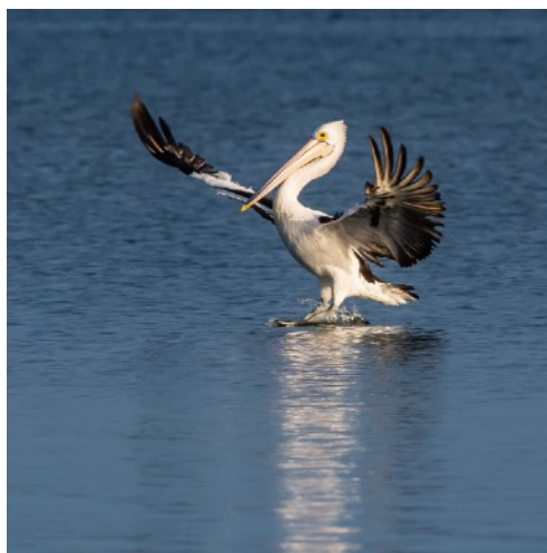
Pelican landing - on water??? - also at Herron Point which is a great spot for bird watching.