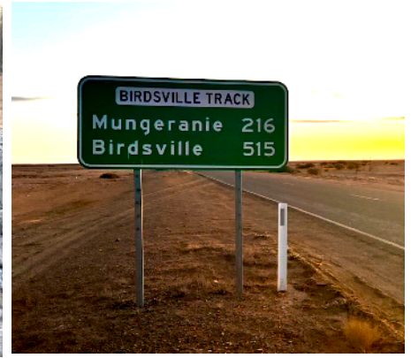
Sunrise on the Birdsville