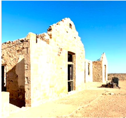
Old Ghann railway siding