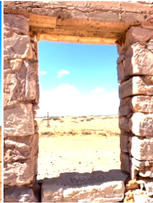
Tribute to Australia's first Mosque in Maree