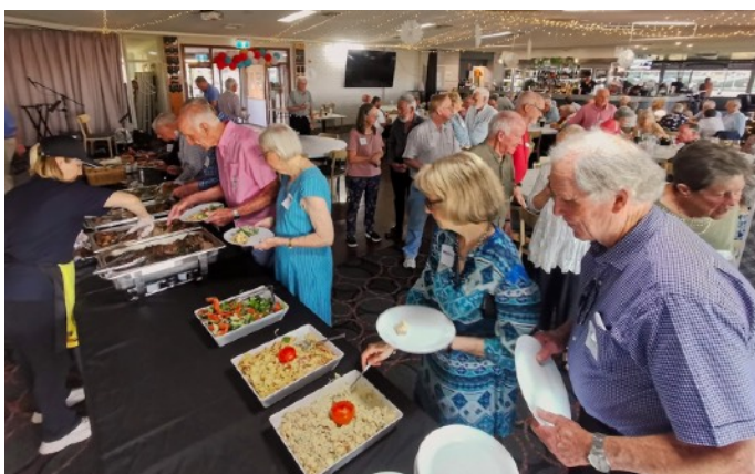
What to choose???