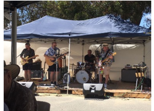
The ever popular KATZ