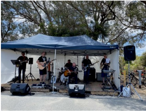
ShedBoys giving a fine performance