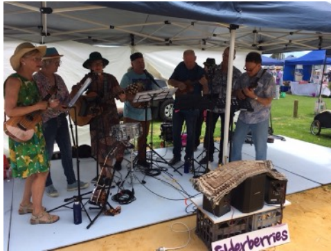
Elderberries UKE Band