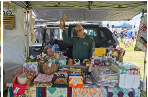
“Mosman Heights Action Group” – even a little bit of local politics was allowed in! The car and bikes display had many admirers One of many happy stall holders